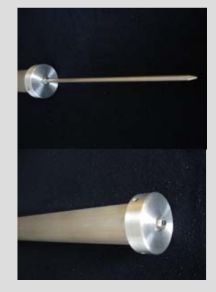
Optional lightning rod