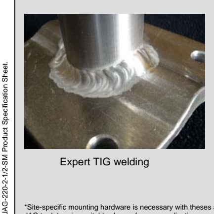
Expert TIG welding

JAG to determine suitable clamps for your application